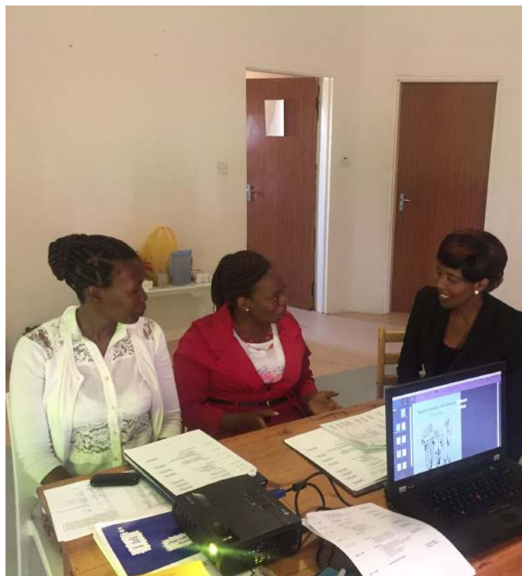
Shekgalagari Literacy Specialists at work learning how to make books in Shekgalagari using Bloom